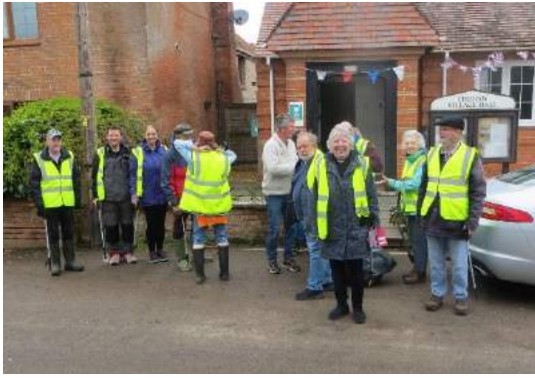
Litter picking group on the Sunday as part of the Big Help Out (Pleased to say Chedzoy was fairly tidy)