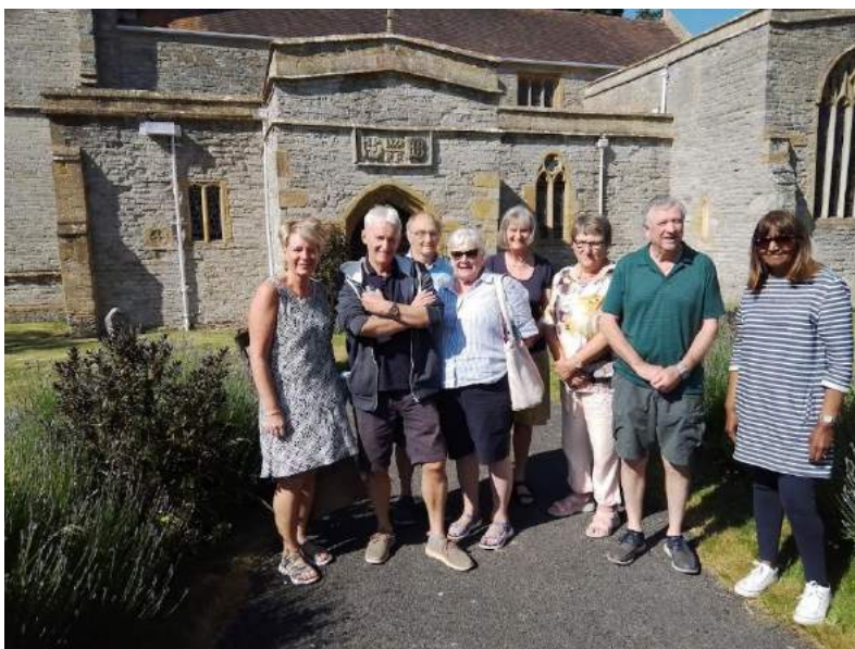
On the left is a group of Wembdon Campanologists who graced Chedzoy Church with their Bell Ringing skills, while on a mini-tour of local churches